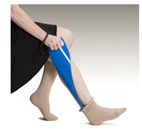
Sock-EEZ (Stocking removal)