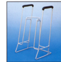
Compression Stocking Donner