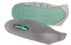
Anti-Shox Gel Soles