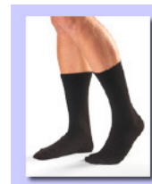
Compression stockings and socks