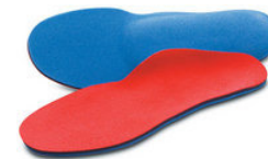
Lynco Sports Orthotics