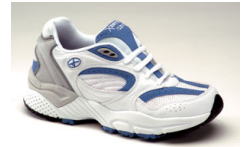
Aetrex Athletic Shoe